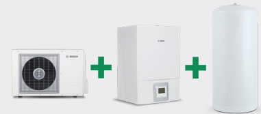
Outdoor unit / Indoor unit / Cylinder

Flexible and future-ready, the CS3400i is available in 4 outputs: 4, 6, 8 and 10kW, and as a heat pump or hybrid heat pump system set-up, making it a great choice for many homes.